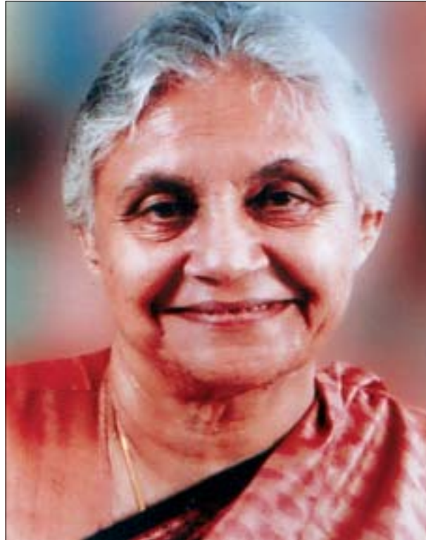
Smt. SHEILA DIKSHIT Hon'ble Chief Minister, Govt. of NCT of Delhi and Hon'ble Chairperson of General Council of NSIT Society